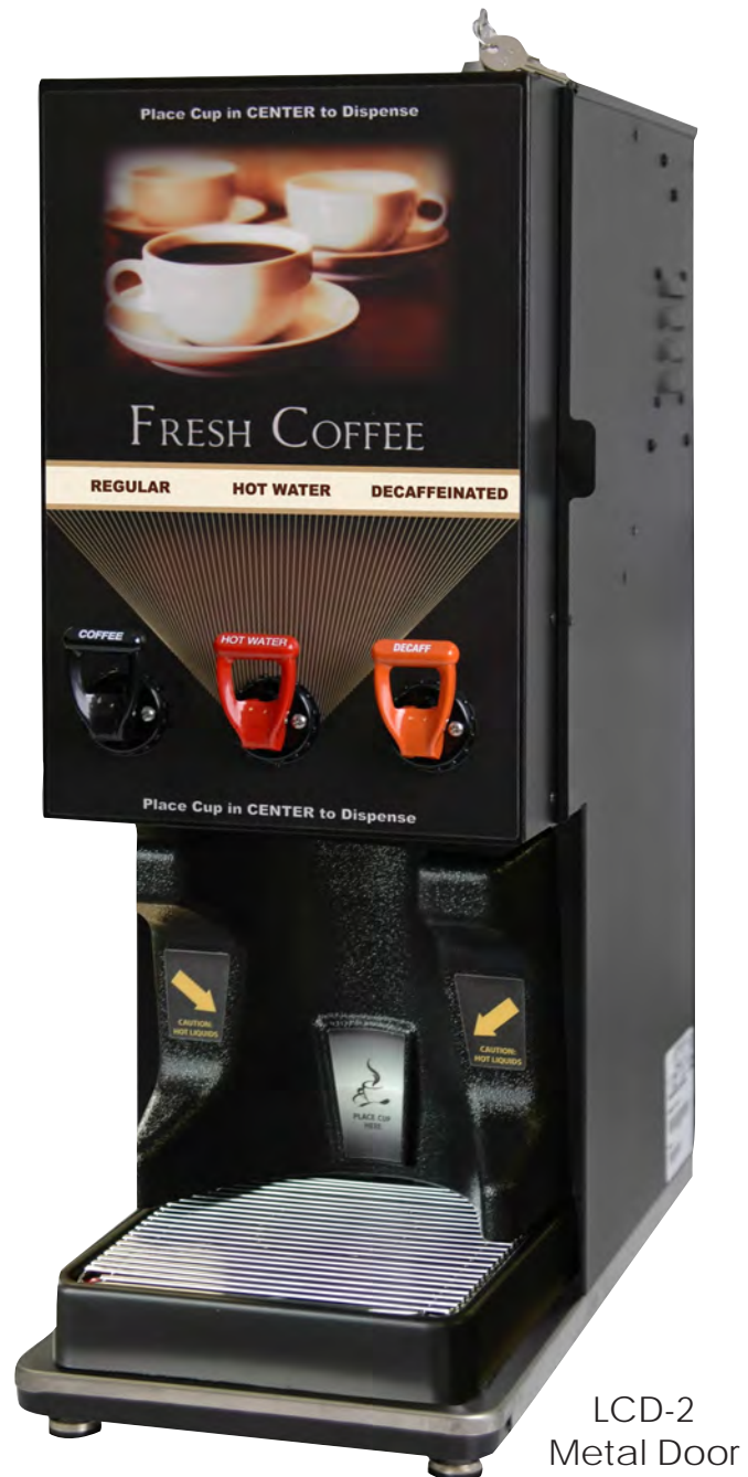
LCD-2 Metal Door

Only 9.9" wide, 26.07" tall, 16.68" deep. The LCD-2 Metal door with faucet dispense is designed for locations that prefer a more traditional style of dispensing coffee on demand. Each faucet can be set to deliver coffee at an individual ratio while the hot water faucet is available for allied product sales. A locking cabinet helps increase product security while the large graphic panel promotes a high quality image of your products.